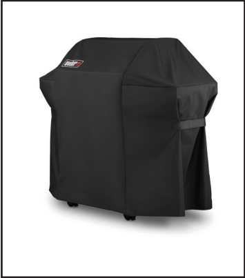
Spirit BBQ Cover This weather-resistant cover will keep your barbecue in top-shape and comes with fastening straps to keep it secure even in windy conditions.