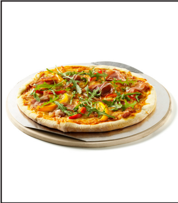
Pizza Stone Large Enjoy crispy gourmet pizzas in your own backyard. The easy serve pizza tray makes it simple to handle pizzas going onto, and coming off of, the barbecue.