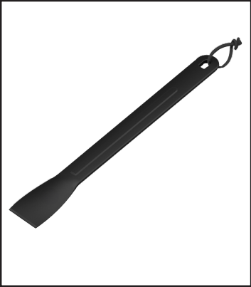
Cookbox scraper Keep your barbecue cookbox free of grease build-up and food scraps.