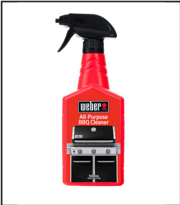
All purpose cleaner Keep your Weber barbecue looking its best. Its unique formula will remove grease, fat and smoke stains, to keep your barbecue clean.