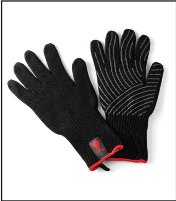
Premium gloves Protect your hands from a hot barbecue and keep a good grip on your barbecue tools with the silicone palms.