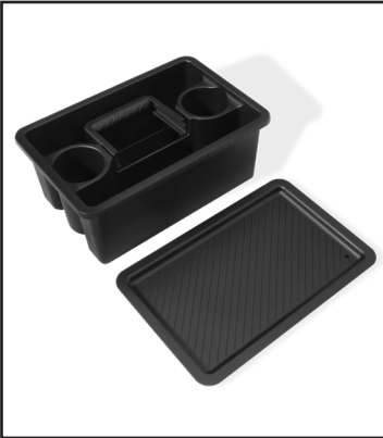
Weber Works Caddy with Tray Lid Transport items easily from the kitchen to the grill with the Weber Works™ Drop-in Caddy with Tray Lid.