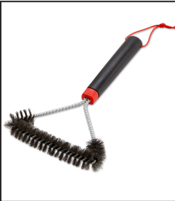
Small grill brush This three-sided grill brush is made to remove grease and debris from cooking grills of all sizes. The handle design provides a secure grip when brushing off stuck-on food or cleaning tight spaces.