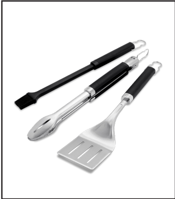
Precision tool set This premium set of tools, all with soft touch handle, includes a 3-sided beveled edge spatula, hands-free locking tongs and full-size silicone basting brush.